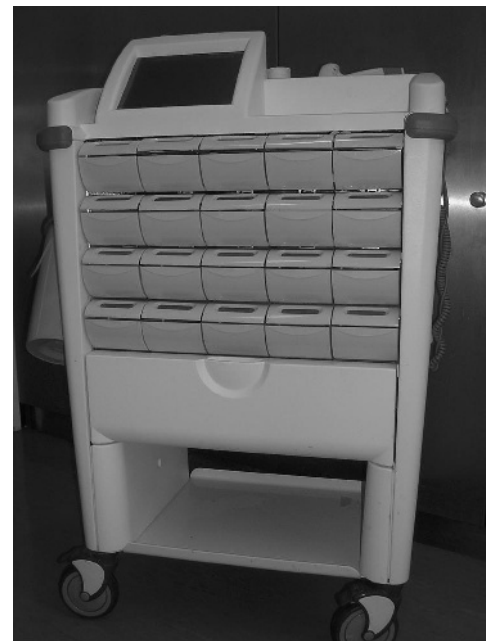
Figure A3 One of the two electronic drug trolleys. One drawer is allocated to each patient for whom medication is due and their name shown on the liquid crystal display. The barcode scanner is on the top of the trolley.