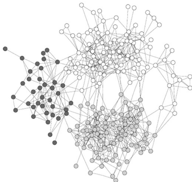
Figure 1 Friendship clusters in a US school. Reprinted with permission from Moody J. Peer influence groups: identifying dense clusters in large networks. Soc Netw 2001;23:261–83.

The stage at which a critical mass for sustained or escalating momentum in any system is reached is what Gladwell calls a “tipping point,” 18 an idea used in classic epidemiology. It is the pivotal juncture at which a concept, social movement or epidemic takes hold. 44–45 One or more triggers may be needed for a state change. Although there are many potential candidates, several stand out: persuasive, catalytic individuals, 46 memorable, even irresistible messages 47 and conducive contexts. 45 A tipping point is not easy to evoke. An example in medicine that has taxed the best